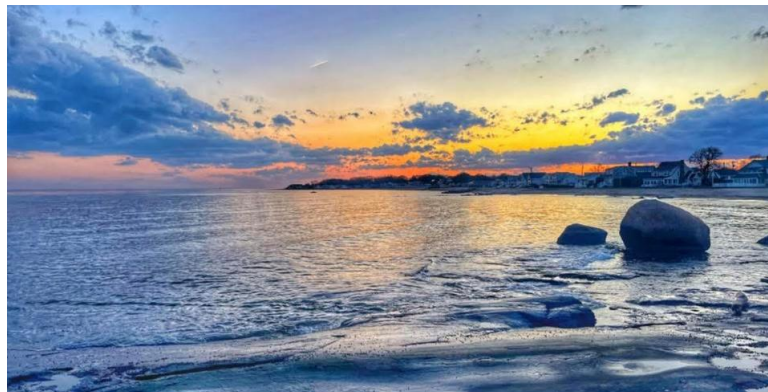
Old Lyme Shores Neighborhood >